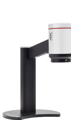
U10 with Antistatic body

U10s, a stand-alone, totally configurable system with a variety of mounting solutions. Select between any of Inspectis' Boom type, XY-type or Articulated arm stands.