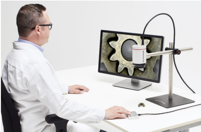
U10s, Stand-alone 4K system with Single-arm Boom Stand

Inspectis Ultra HD digital microscopes provide relief to eyes, neck and shoulders through the unique ergonomic design and 230 mm free working distance. By allowing operators to sit comfortably in a good working position, their inspection tasks can be carried out more efficiently.