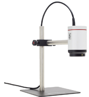
U10s with Single-arm Boom Stand

”Designed according to industry standards”