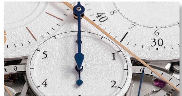
Micro mechanics, x5 Zoom, 12x Mag.