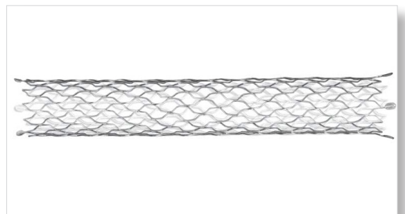
Medtech, x10 Zoom with +5 Macro, 50x Mag.