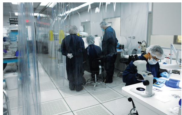
FMI houses clean rooms, fully equipped for silicone mixing, molding, inspection and packaging operations.

As a medical silicone company, FMI complies with qualification processes that ensure silicone material cleanliness, part shape integrity and the lowest failure rates. Important in this regard is FMI's choice for the table-top iNexiv system from Nikon Metrology, a high-performance CNC precision video measuring system. FMI demands an optical system because silicone parts are too soft to be measured using a touch