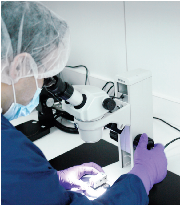
In addition to the iNexiv CNC video measuring system, FMI uses many stereomicroscopes from Nikon.